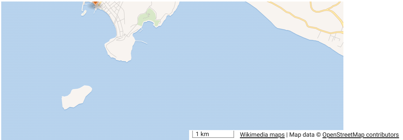
Map of Erdek